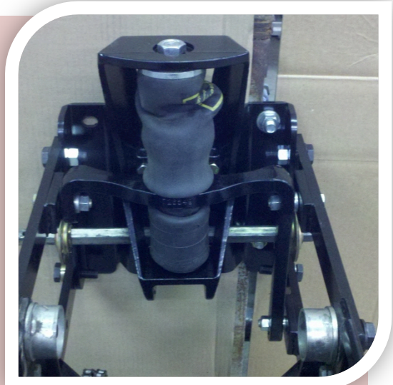
All parts mounted on a display stand. PP 726520 AirForce Bracket kit in black.