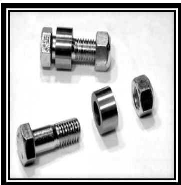
Shoulder Bolt Kit. $30/row