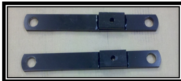
Upper Parallel Arm Bracket. $18/each