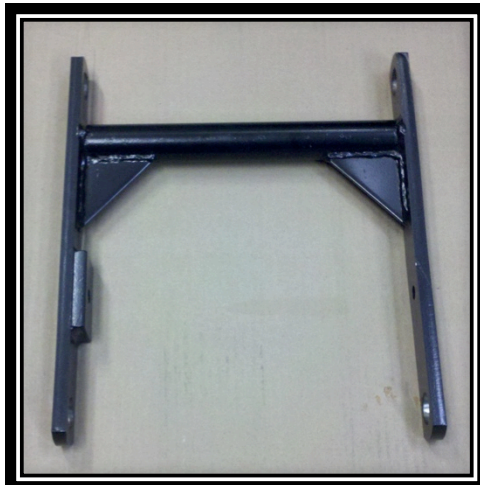
Lower Parallel Arm Bracket. $55/each